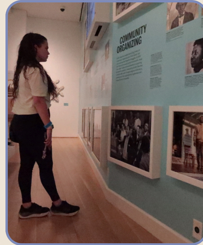
Top: Beidler Forest, Bottom Left: Avery Center, Bottom Right: IAAM