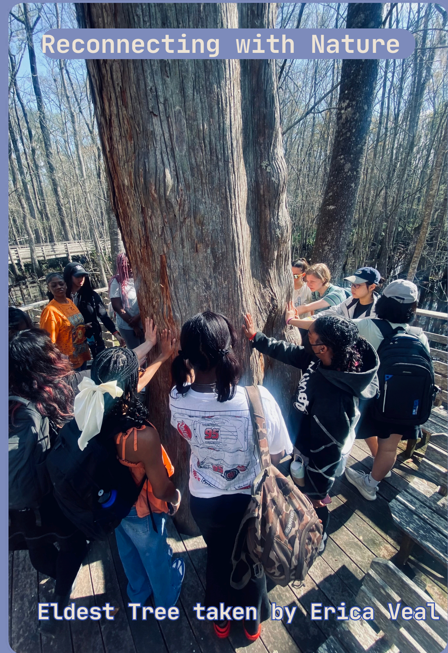
Eldest Tree