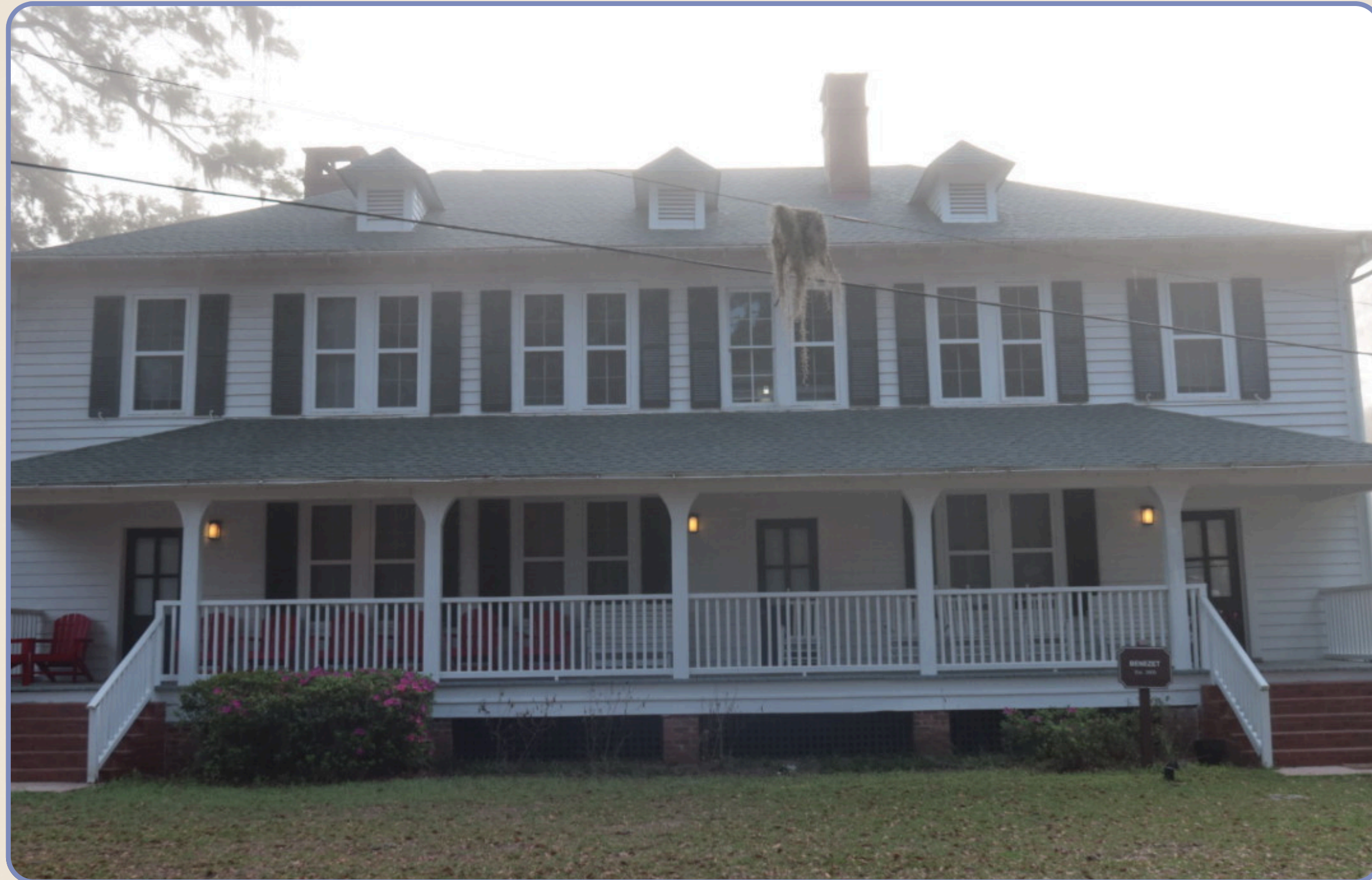
Benezet House